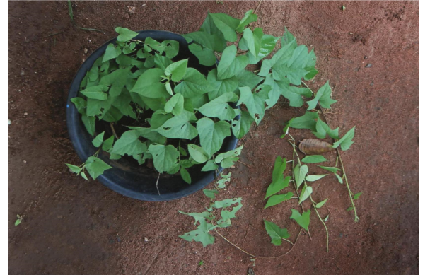
Plate1: Experimental setup photo of sweet potato plants