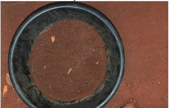
Plate 2: Experimental setup photo of uncontaminated soil (Control)