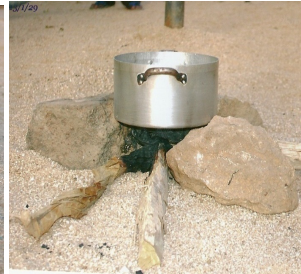
Figure 1: WBT on 3 – stone fire