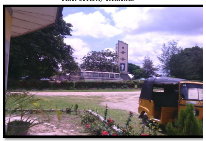
Plate 3: Soft landscape use to direct traffic within church site at St Michael Catholic Cathedral, Minna Central West.