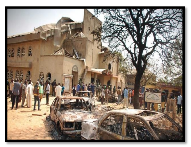
Plate 1: The bomb effect on the building of St Theresa Church at Madalla

Plates 1 shows St Theresa Catholic church at Madalla, Niger state which was bombed on 25th December, 2011 (Christmas day). The plate gives a pictorial view of the effect of the explosion on the building and the vehicles. As observed there were no restrictions as to a clear car park, which led to the close range of parked cars to the building. Although a tree was within the premise, it is observed that this landscape element was not planted with the aim of deterring intrusion upon property and so was not used as a security measure.