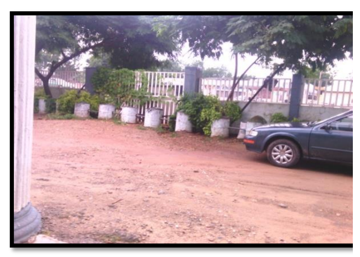
Plate2: RCCG at Tunga West showing use of soft landscape to soften and enhance the appearance of perimeter fences and other security elements.

having used soft landscape to soften the hard effect of bollards, amongst some other churches for having purposefully utilized soft landscape as security measures. St Michael Catholic Cathedral as seen in Plate 3 for using landscape elements to direct vehicular and pedestrian movement.