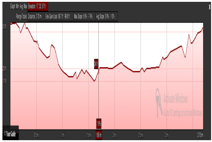
Figure 2: Elevation Profile of Port Harcourt