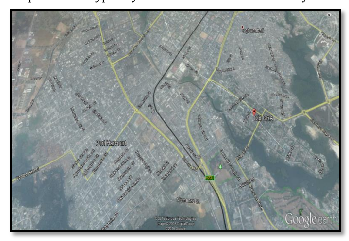
Figure 1.: Map of Port Harcourt

Port Harcourt is the capital and largest city of Rivers State, Nigeria. It lie along the Bonny River and it is located in the Niger-Delta region. As of 2016, the Port Harcourt urban area has an estimated population of 1,865,000 inhabitants, up from 1,382,592 as of 2006. It lies on the 4^0 49"N 7^0 21"E. temperature throughout the year in the city is relatively constant, showing little variation throughout the course of the year. Average temperature is typically between 25^0 c - 28^0 c in the city.