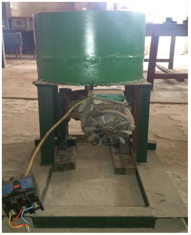
Figure 3: Pictorial View of the Sand Mixer