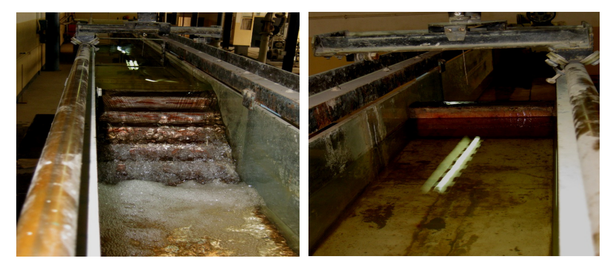
Figure 3: Left: Tilting flume showing approach flow to the model. Right: Flow over the stepped spillway laboratory model