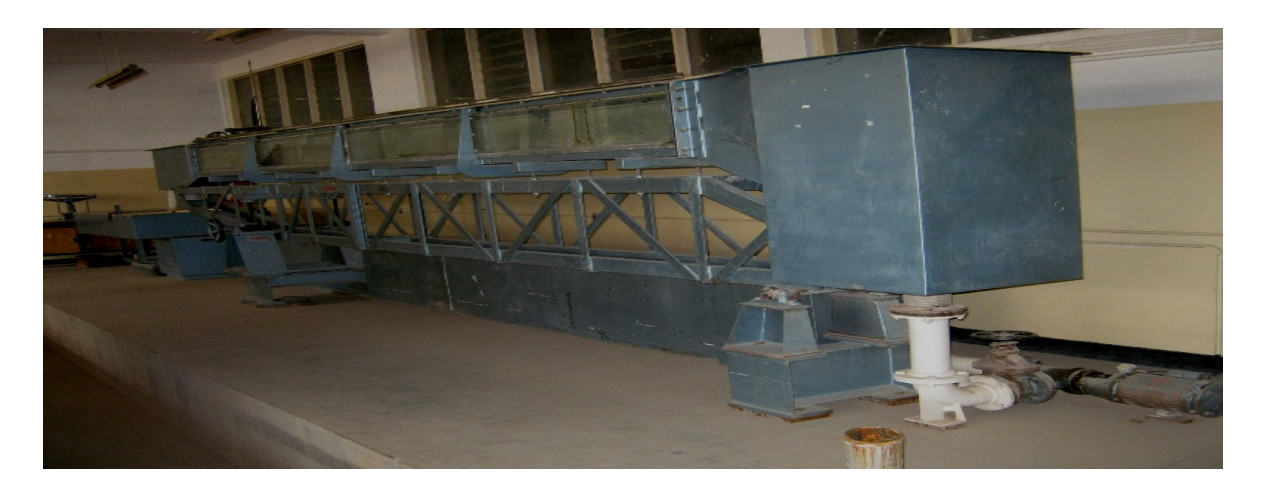
Figure 2: Pictorial view of the tilting flume used for the study.