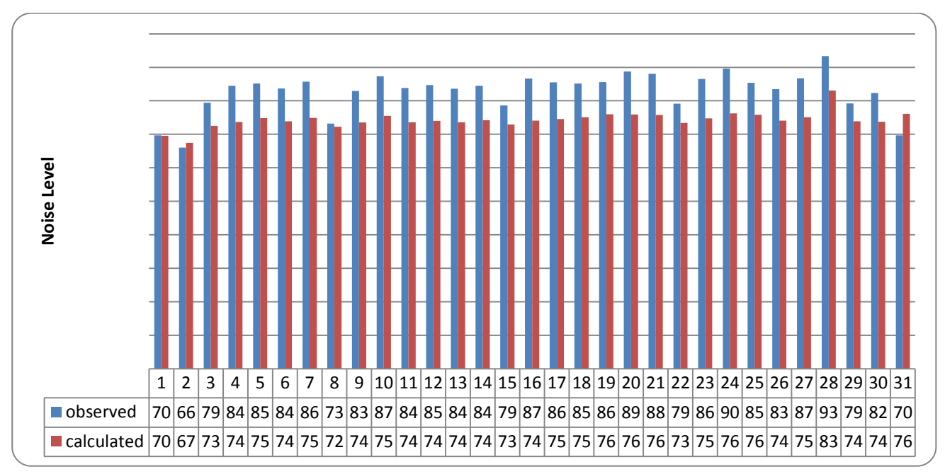
Figure 3: Bar Chart of Observed Noise Level d B(A) against calculated Noise Level dB(A)

Annoyance due to road traffic noise was found to be higher especially in the evenings and mornings which are generally referred to as rush hours. People living or undertaking commercial activities within Ramat Park are daily exposed to high levels of traffic noise which is as a result of indiscriminate and reckless activities of drivers within the Park and also the increased number of honking and horning couple with the high volume of vehicles congesting the area. The resultant effects of this environmental hazard are stress, sleeplessness and psychological effects.