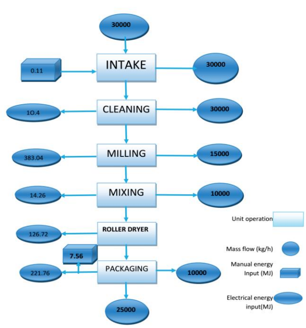
Fig 3: Energy and material balance diagram of breakfast cereal production operations.