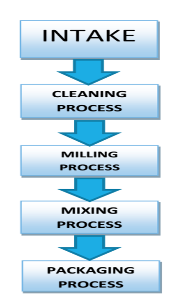
Fig 1: Flow diagram of maize milling

The production process is divided into five unit operations: (i) Intake process, (ii) Cleaning process (iii) Milling process (iv) Mixing process (v) Packaging process. The process flow chart for the production process is shown in Figure 1.