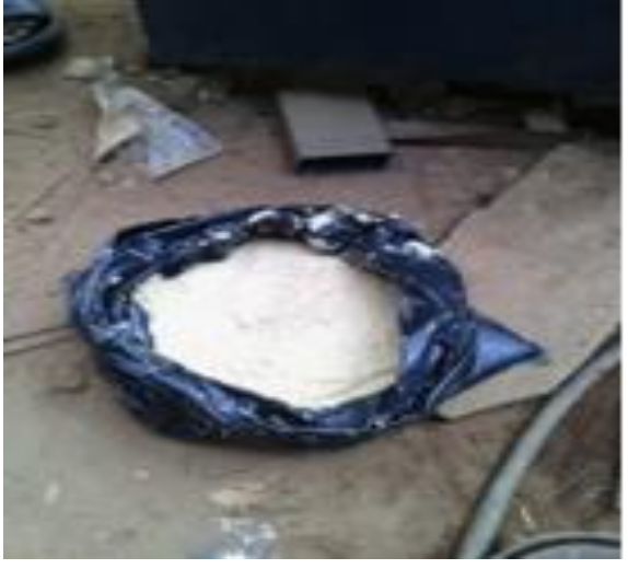
Figure 6: Plantain Flour

This implies that 65.54% of water composition was actually used in the pulverized plantain pulp. However, the plantain flour must be free from water, thus the