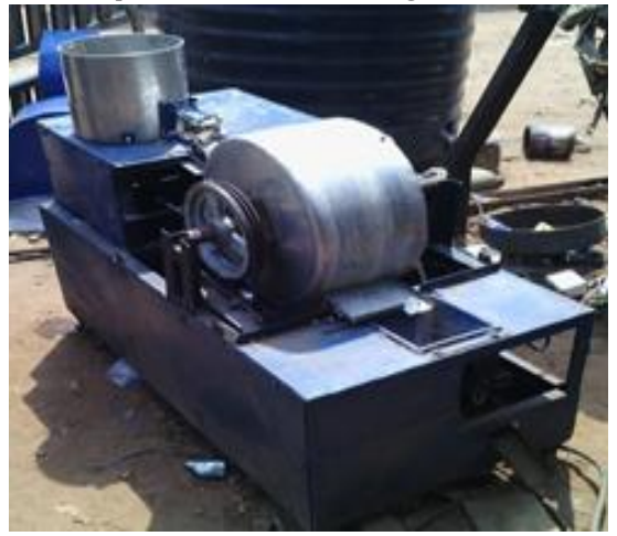
Figure 3: Fabricated Improved Plantain Processing Machine

Figure 5 shows the flow of paste through the pulverized outlet.