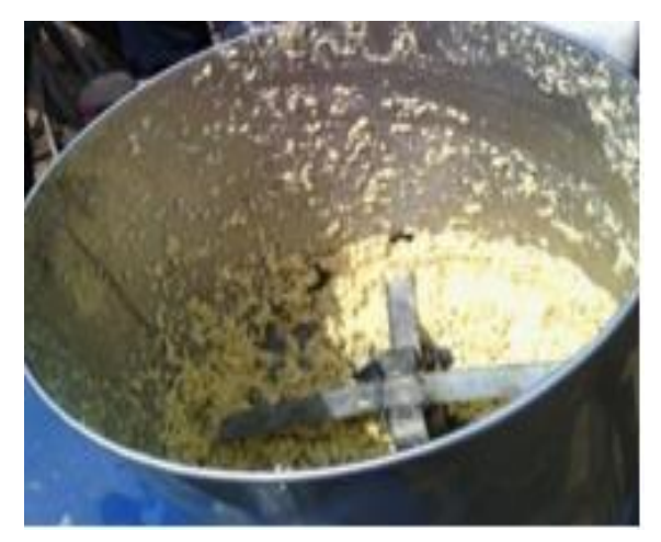
Figure 4: Pulverized Vessel and Product

composition of water present in the mixture by mass was determined as 65.54%.