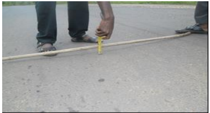
Plate 1: Depressed Portion of Carriageway (Chainage 2+750 – 2+850)