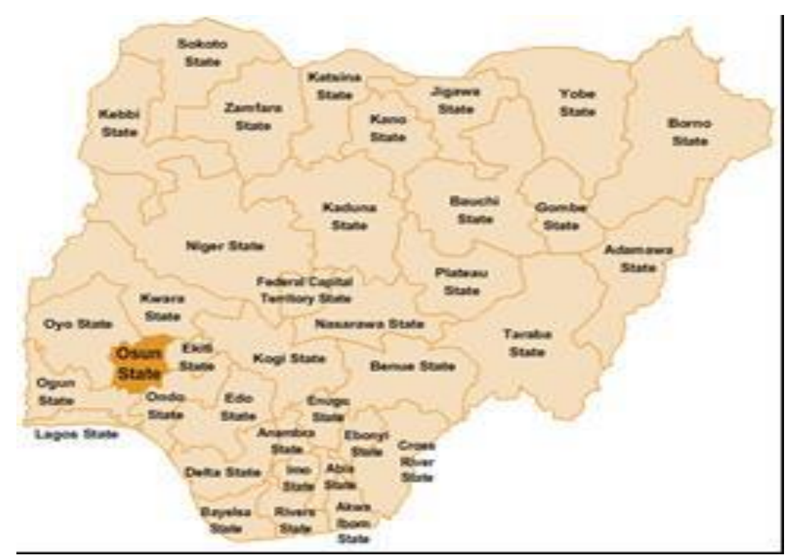
Figure 1: Map of Nigeria Showing Osun State

Evaluation would assist in evolving various strategies that can be used to decide on pavement restoration and rehabilitation policy [12].