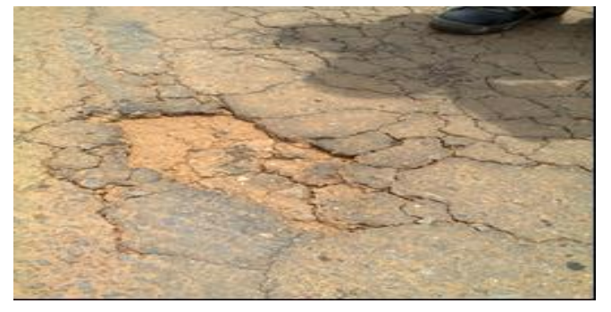
Plate 5: Delineation (Chainage 2+950 – 3+050)