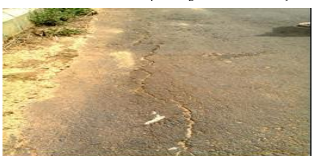
Plate 4: Longitudinal Crack (Chainage 3+050 – 3+100)