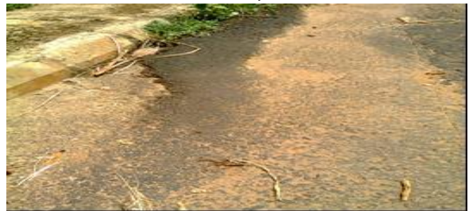
Plate 3: Shoving (Chainage 3+150 – 3+175)