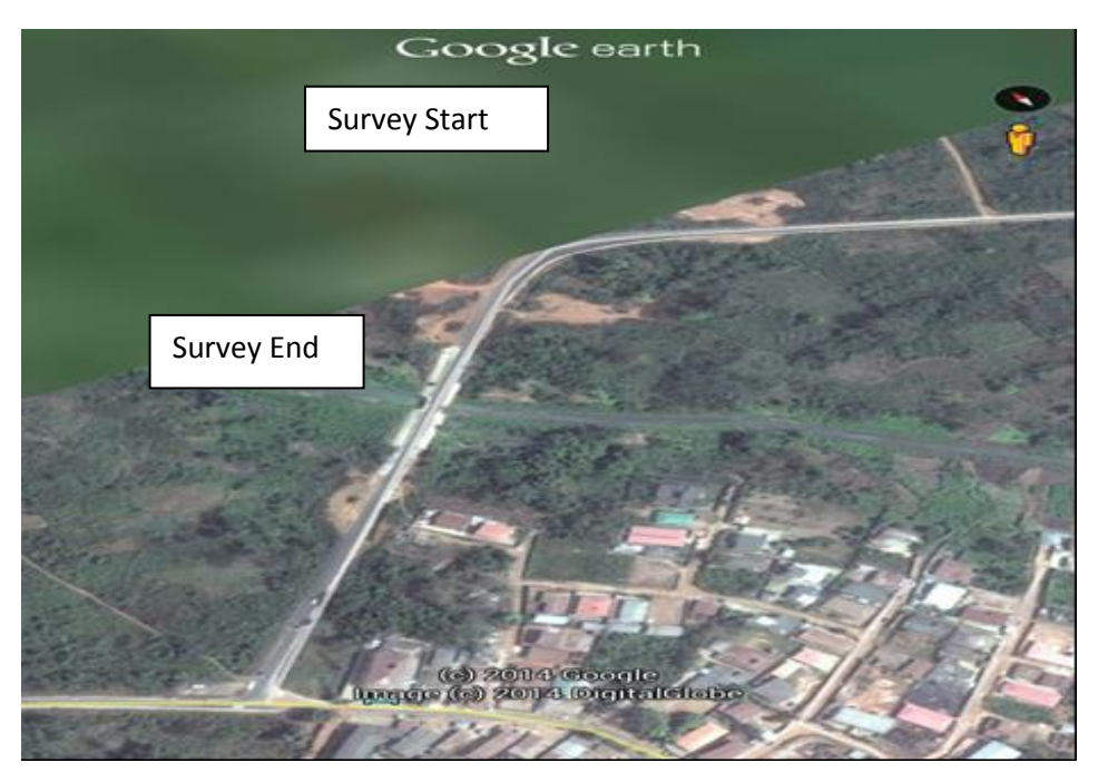
Figure 2: The study route