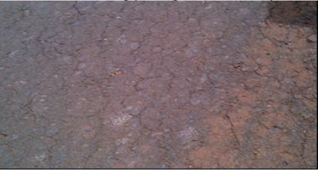
Plate 10: Hair Cracks (Chainage 2+950 – 3+050)