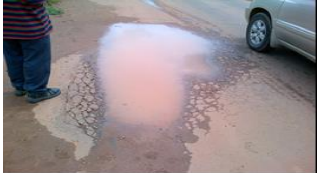
Plate 6: Rut, depression, Cracks, Shoving (Chainage 2+950 – 3+050)