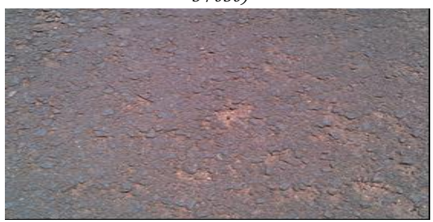
Plate 8: Ravelling (Chainage 3+150 - 3+175)