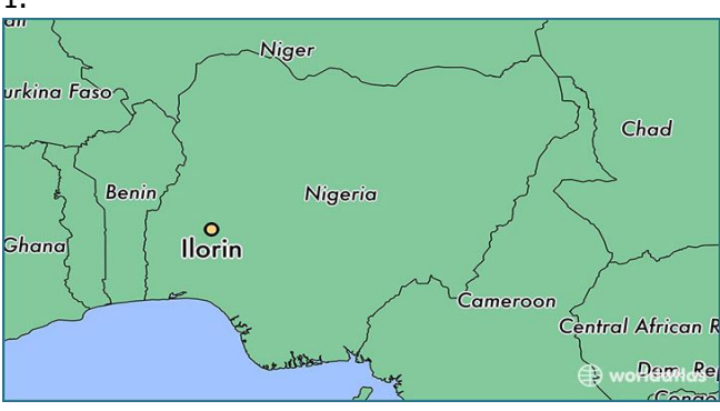
Figure 1: Location map [17]

The location areas are Ilorin, Lagos and Akure. Ilorin city occupies an area of about 468 sq.km and at an elevation of 320m above sea level. It is about 300 kilometres away from Lagos and 204 km from Akure [16]. The three cities experience two climatic seasons-the rainy and dry seasons. The rainy season is between March and November, and the annual rainfall varies from 1000 mm to 1500 mm each, with the peaks between September and early October. The study location towns can be located on the map of West African sub region of Africa as shown in Figure 1.