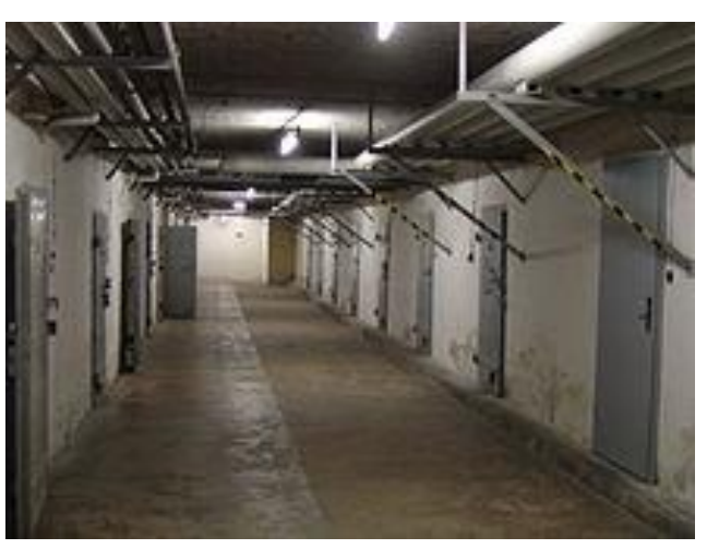
Figure 3: Typical Bank Cellar