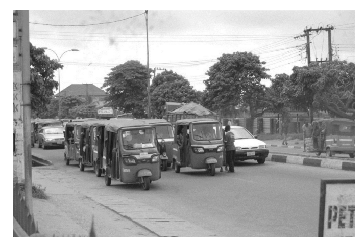
Figure 3: Vehicular traffic concentration at Udo Udoma intersection.

TT-Total traffic; (L & H)- Light and Heavy; LTT- Left Turn Traffic; RTT- Right Turn Traffic.