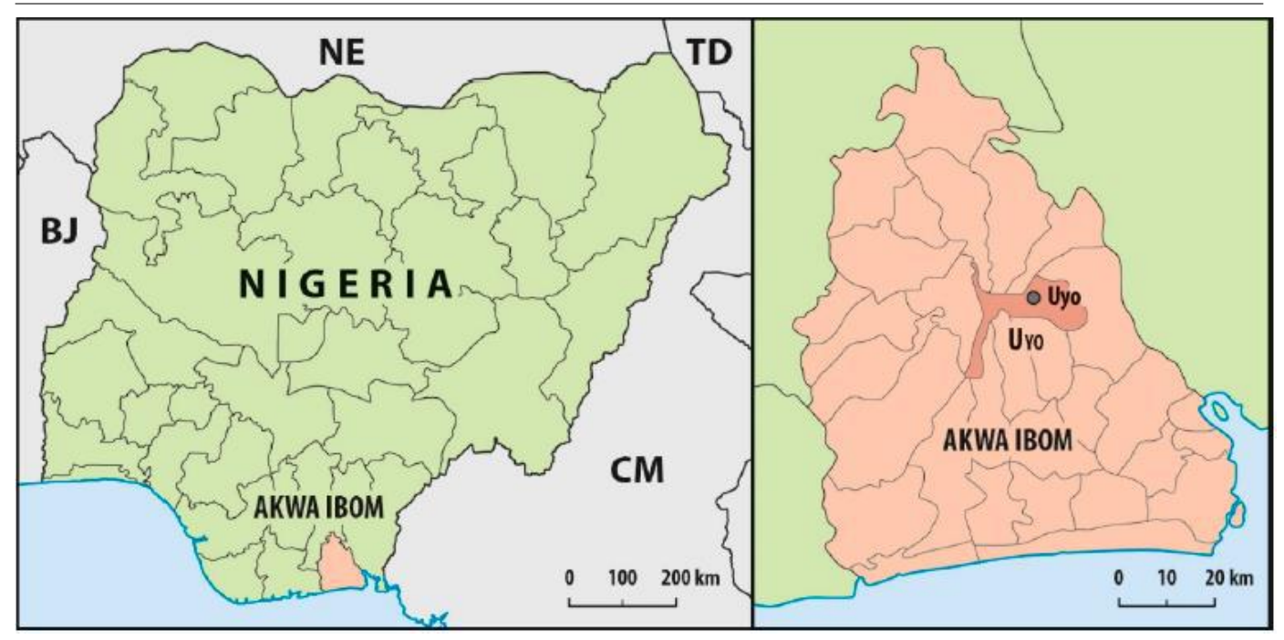
Figure 1: Map of Nigeria showing Akwa Ibom State, and map of Akwa Ibom State showing Uyo capital city.

their homes and jobs, get services, and so on, using tricycle vehicle as major means of intra-urban transportation system. There are nine (9) signalized intersections in Uyo out of which five (5) signalized intersections experience increasing rate of tricycle during morning and evening periods and are prone to traffic congestion. This study considered Udo Udoma Intersection, Four Lanes Intersection, Mayflower Intersection, Udo Umana Intersection and Udo Eduok Intersection.