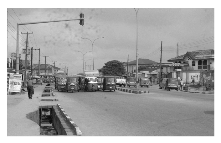
Figure 5: Vehicular traffic concentration at Mayflower intersection. \\ \\