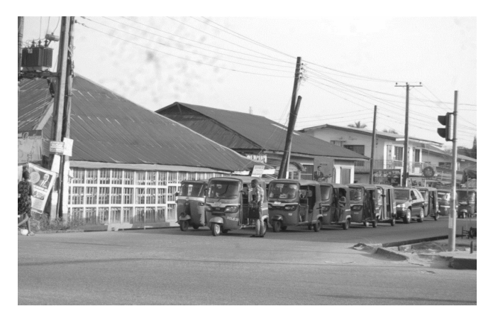
Figure 6: Vehicular traffic concentration at Udo Umana intersection.