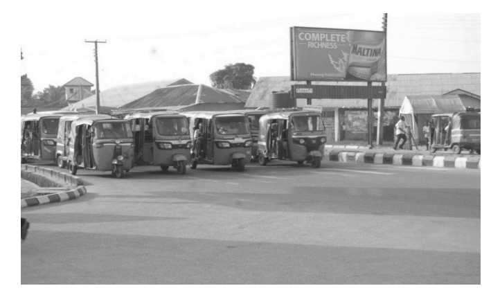
Figure 4: Vehicular Traffic Concentration at Four-Lane Intersection.