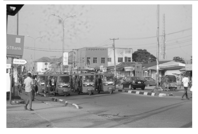
Figure 7: Vehicular traffic concentration at Abak road – Udo Eduok intersection.

adopted. Field measurement saturation flow is calculated independently for each phase of the selected intersection by obtaining vehicular traffic count for 154 days at 10 cycles of each phase of the signalized intersection selected for this study as shown in Table 2. All vehicular traffic is added and then average over observed period. The average vehicular departure is divided by the effective green time to obtain field measured saturation flow in vehicles per hour green.