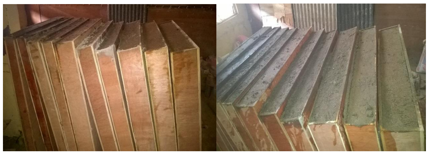
Plate 3: Cross section of sawdust-crete laminated composite slabs.