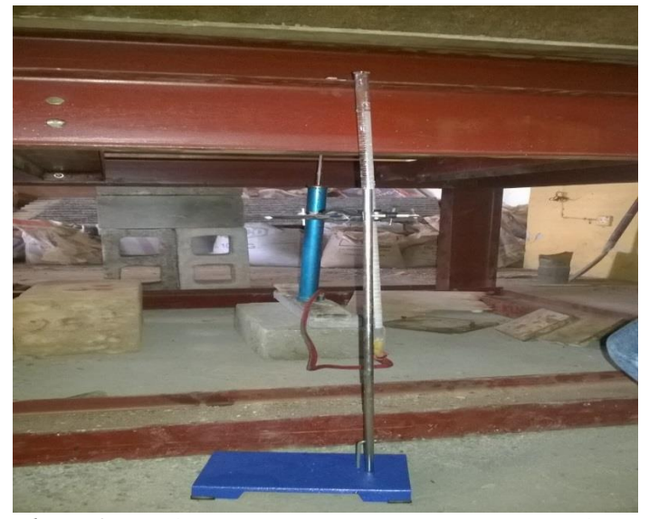
Plate 4: Deflection measurement using principle of incompressibility of water

The deflection of sawdust-crete laminated composite and conventional slab were measured using displacement of water approach as can be seen in Plate 3.4. The instrument used was constructed using the principle of incompressibility of water. The load from the slab was allowed to act on the T-flange pump that was filled with water and connected to burette that contain water to a particular level. When the slab fails, the changes in height of water in the burette and pump pipe were recorded and having known the areas of the T-flange pump and the burette, the deflection was computed.