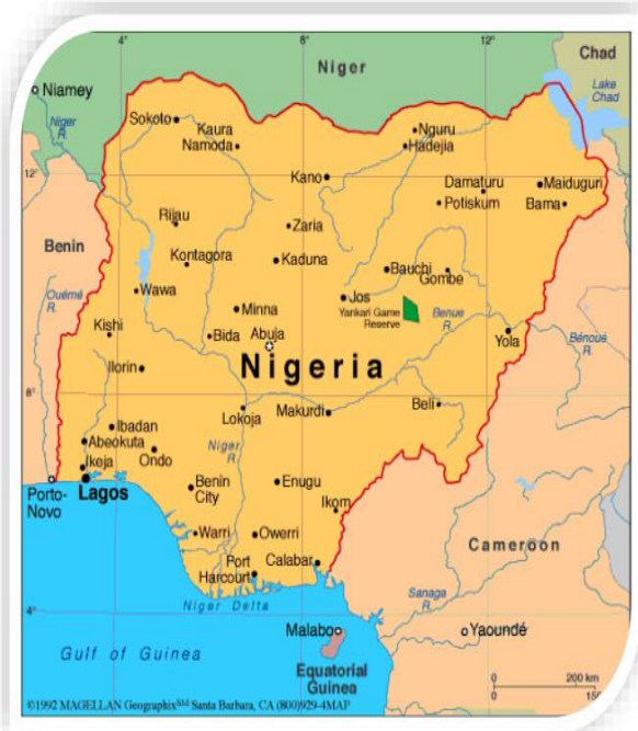
Figure 1: Map of Nigeria showing 36 States and the FCT.

Nigeria (Figure 1) is a developing country in West Africa with 36 states and the Federal Capital Territory. Nigeria is a West African nation with a geographical area of 923,768 square kilometres and a longitude ranging from 2 to 15 degrees East and latitude ranging from 4 to 14 degrees North (UNOCHA-Nigeria, 2020; Shaaban et al , 2014). It has a western border with Benin Republic, and northern and southern borders with Niger and Chad, respectively. Nigeria has two seasons; a rainy season that lasts from April to October and a dry season that lasts from November to March.