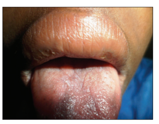
Figure 3: White and black plaques on the tongue