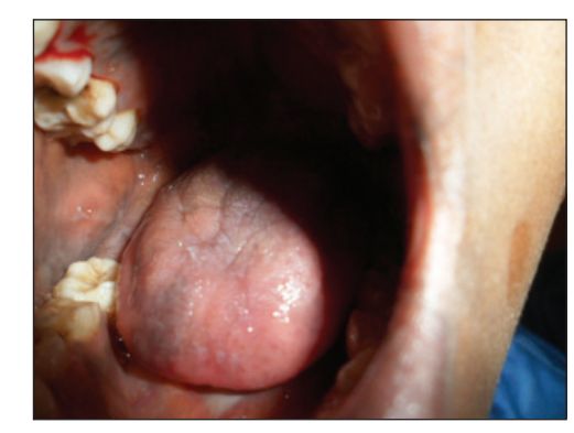
Figure 4: Dental caries with gum bleeds