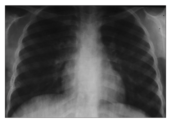
Figure 4: Chest radiograph with bilateral hilar opacities