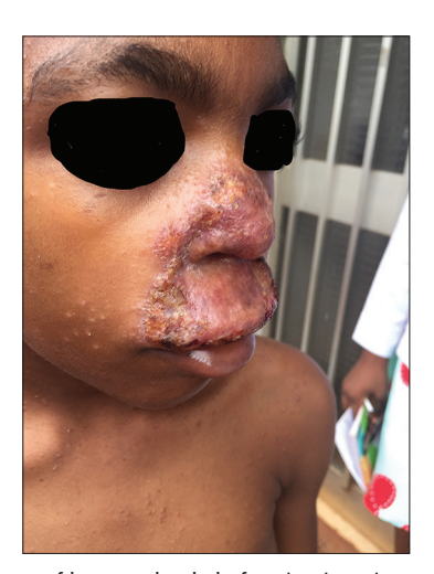
Figure 1: Lesions of lupus vulgaris before treatment

Mantoux test showed a >20 mm induration after 48 h as shown in Figure 3. Patient had, however, received BCG vaccination at birth as part of the National Program of Immunization. The erythrocyte sedimentation rate was 104 mm in the 1st h. Full blood count showed packed cell volume of 34%; white blood cell count of 6.1 \times 10^9 /L with differential of neutrophil 53%, lymphocyte 41%, eosinophil of 3%, and monocytes 4%. Retroviral screening test was negative. The chest radiograph revealed bilateral hilar opacities [Figure 4]. A skin biopsy was taken from the facial lesions with the aid of a 5 mm punch set for histopathology. Histopathology showed ulcerated