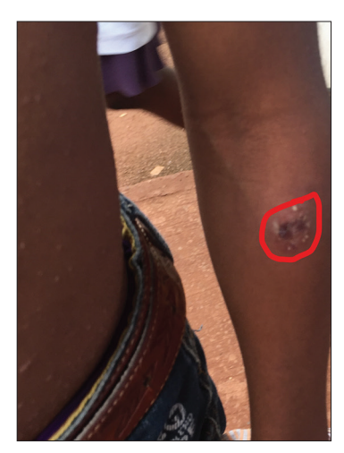
Figure 3: Site of tuberculin skin (Mantoux) test

areas with impetiginisation and keratopurulent debris. The entire skin showed pseudoepitheliomatous hyperplasia with numerous granulomas in the superficial dermis made up of Langhans-type multinucleated macrophages. There was also dense infiltrate of neutrophils and eosinophils in the dermis [Figures 5 and 6].