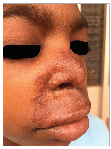
Figure 7: Lupus vulgaris after intensive phase of treatment

on the affected site of LV lesion [Figure 7]. There was also a significant resolution of regional lymph node swellings and minimal improvement of the chest radiographic findings.