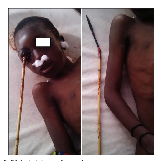
Figure 4: Clinical pictures of case 4

Ear, nose, and throat team was called to the accident and emergency to review a 15-year-old cattle rearer, who was brought in death. The patient was attacked by cattle rustlers while moving their cows to grazing area 48 hours before presentation, he sustained an injury to the right eye, there was associated history of bleeding from the nose [Figure 4]. Parent confirmed that there was attempt at the removal of the arrow at home. Examination revealed lifeless body with no sign of respiration or cardiac activity, arrow was seen impacted into the right supra-orbital region, leading to the brain. There was