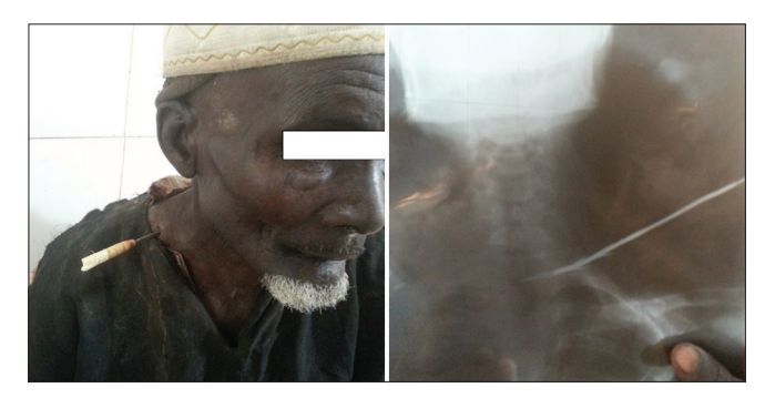
Figure 1: Clinical picture and X-ray of case 1

blurring of vision and diplopia on the same side. Examination revealed an impacted arrow in the medial canthus of the left eye [Figure 3], mucopurulent eye discharge, and decreased visual acuity on the same side. Contralateral eye was normal. Computed tomography (CT) scan shown impaled arrow that passed through the flour of the orbit obliquely downward in to maxillary sinus [Figure 3]. The patient had exploration and removal of the arrow through Lynch-Haworth incision, the flour of the orbit was repaired, and maxillary sinus was