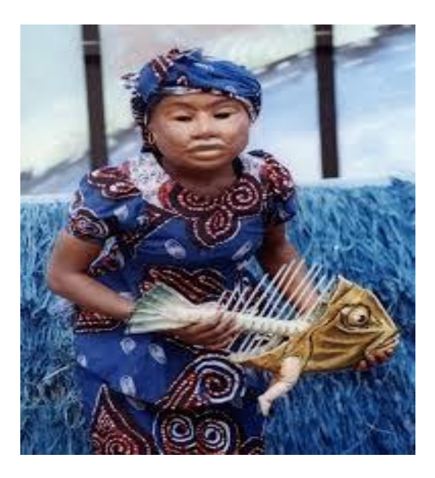
Fig. 3: Destroyed Environment

The picture above depicts an environment that has been destroyed by oil exploration and exploitation. The destruction is so pervasive that farmlands are damaged and rivers polluted. Because of this, the farmlands cannot bear produce and the rivers do not have fishes. This translates to poverty. The poverty is worsened by health complications that result from polluted sources of drinking water, polluted agricultural produce, acid rain, heat from gas flaring among other aberrations that arise from oil production activities in the Niger Delta.