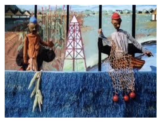
Fig. 4: Boma and Destroyed Fish

The picture above depicts an environment that has been destroyed by oil exploration and exploitation. The destruction is so pervasive that farmlands are damaged and rivers polluted. Because of this, the farmlands cannot bear produce and the rivers do not have fishes. This translates to poverty. The poverty is worsened by health complications that result from polluted sources of drinking water, polluted agricultural produce, acid rain, heat from gas flaring among other aberrations that arise from oil production activities in the Niger Delta.