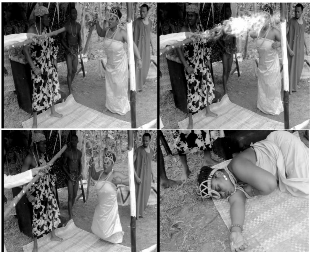
Pix.6: Cross actions of Nwanyimma in her attempt to kill King Amadi and how she met her end