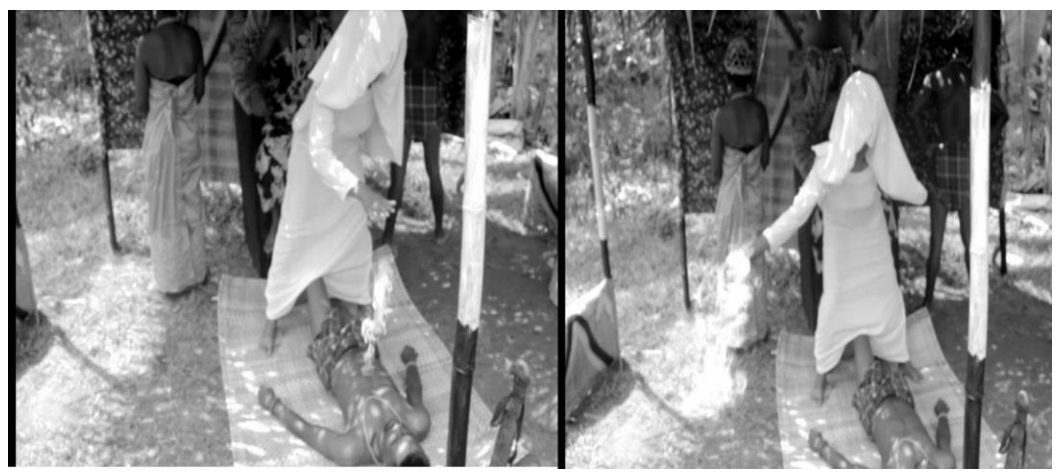
Pix.7: the Dibia dragging away columns of the poison from the body of Amanna

The effect created in Pix No. 7 below during the healing process of Amanna is another merit of this new lighting approach, which also attests to its potentials for the improvement that is being canvassed for economic rejuvenation of the Nigerian live stage.