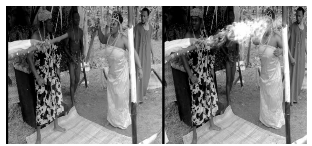
Pix.8:Nwanyimma attempting to stab King Amadi

In the pictures displayed above, Nwanyimma made frantic efforts to stab King Amadi with a sword she grabbed from the floor but was constrained by the "Shrouded Figure" who intercepted her with a mystic staff in her hand. She pointed the staff in the direction of Nwanyimma; using the staff, she disgorges conspicuous particle-likes mystic powers, which blinded Nwanyimma, penetrates into the brain and made her to slump and die.