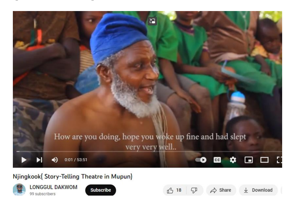
Plate 2: shows the details per number of subscribers, the video and how the subtext on the screen. It also shows that about 18 people liked the content.

In terms of viewership and feedback, the content had about 433 views within 845 days of upload. The implication certainly shows that there is a rise in the views