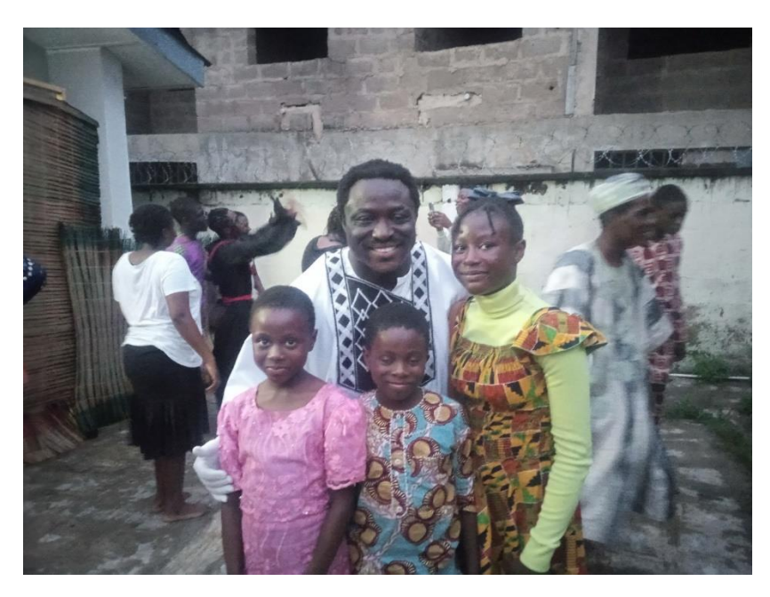
Picture 8: The researcher's elated children and one of the performers who happened to be a household face in Nollywood Christian films.