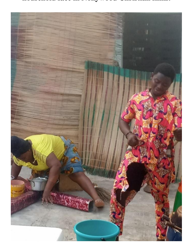
Picture 9: From the performance of Grip Am taken by the Researcher on June 19, 2022