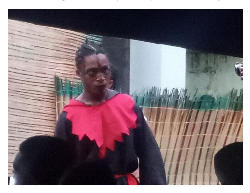
Picture 3: 'Death' from the performance of Eniyan taken by the Researcher on May 15, 2022