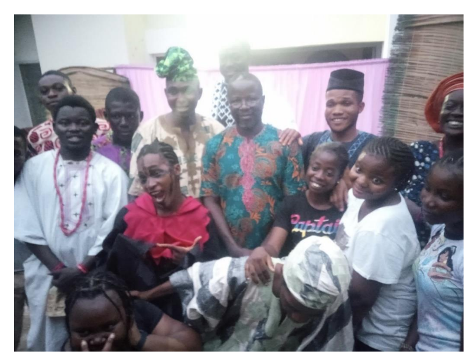
Picture 6: The researcher and some of the performers from the performance of Eniyan