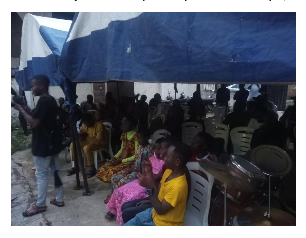
Picture 5: A cross section of the audience during the performance of Eniyan on May 15, 2022