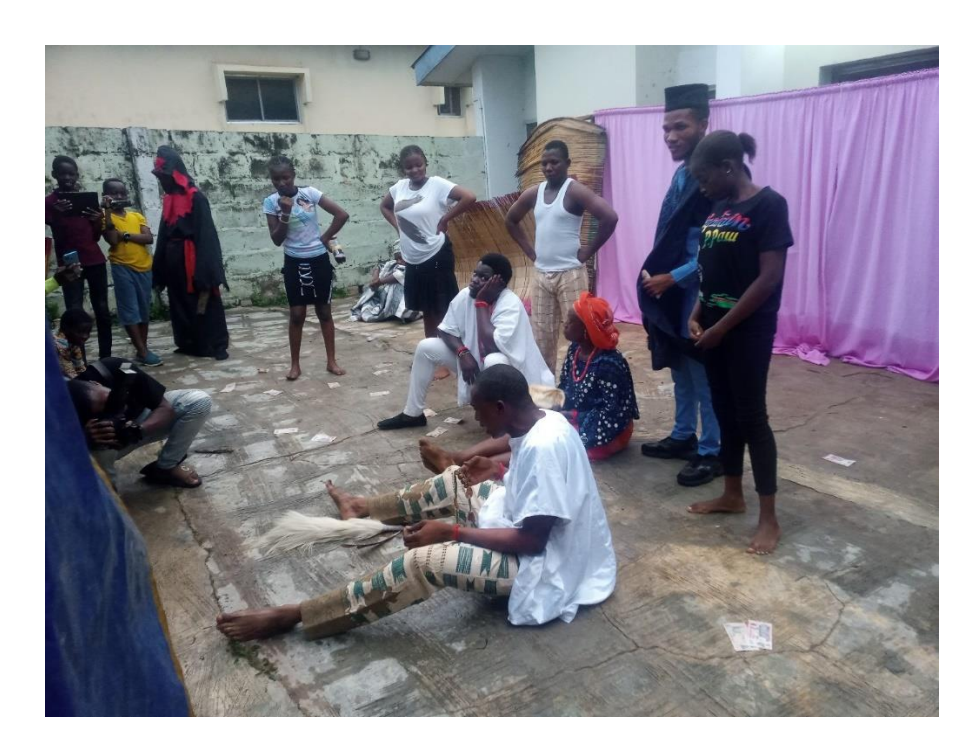
Picture 4: From the performance of Eniyan taken by the Researcher on May 15, 2022