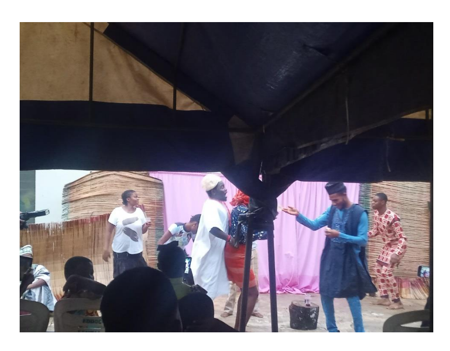
Picture 2: From the performance of Eniyan taken by the Researcher on May 15, 2022