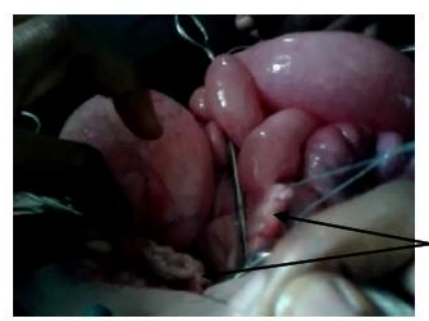
The Proximal and distal stumps of the colon.

the pelvic cavity, and was between the rectal region of the gastroinestinal tract and the vagina, caudal, to the cervix (Fig 2). The rectal and anal canals were atrectic and there was no anal orifice (imperforate anus). The colon was double clamped about 2.0 centimeters (cm) cranial to the fistula and severed between the clamps. The colonic stumps were closed with Parker-Kerr suture pattern using size o chromic catgut, (Fig 3).