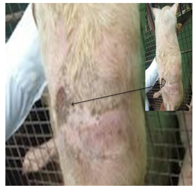
Figure 2: Healing progress after 21 days of treatment

Cutaneous biopsy samples (approximately 4mm<sup>2</sup>) were obtained from the cranial and caudal margins of the lesion. Local analgesia was achieved by infiltration with 1% Lidocaine (Alpha Pharmacy, Nigeria) around the sites of biopsy sampling. The specimens were fixed in 10% neutralbuffered formalin, processed routinely, stained with haematoxylin and eosin (H&E). The lesion was cleaned with mild antiseptic (0.05% Chlorhexidine) and daily application of natural honey (obtained from the Veterinary Surgery unit, University of Ibadan) and Penicillin ointment 100,000 IU, (NIM Pharma Ltd., Nigeria) was done for two weeks. 20mg ascorbic acid, 10mg Augmentin® (GlaxoSmithkline, UK), and a drop of pediatric multivitamin (abidec<sup>®</sup>, Belco Pharma, India) were given orally for