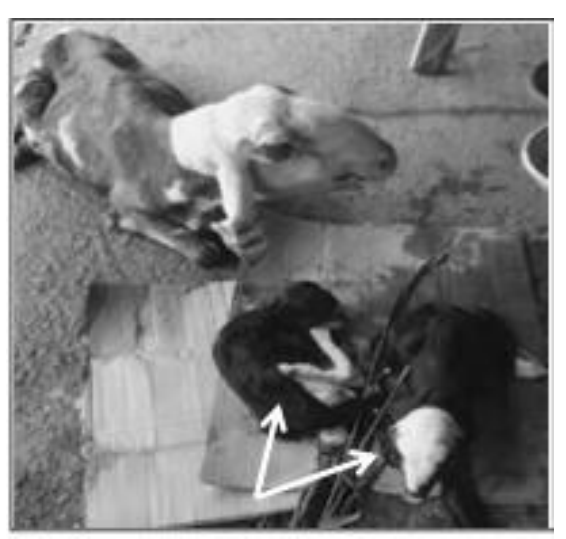
Figure 3: Images of the twin lambs (white arrows) with the Ewe

When twinning in ruminant may increase productivity and makes livestock more profitable as desirable in beef cattle production (Gregory et al., 1996), twining is undesirable in dairy because of its adverse effect on milk yield available for sale (Hossein-Zadeh, 2010). In sheep, occurrence of multiple pregnancies is also contraindicated because it predisposes to pregnancy toxaemia and associated postparturient conditions (Schlumbohm and Harmeyer, 2008). Perhaps, the twining observed in the present case may be partly responsible for the dystocia associated with lambing of the second foetus. Compromise of the expulsive force possibly due to hypoglycaemia or hypocalcemia after the delivery of the first foetus was apparently the primary cause of dystocia in this case