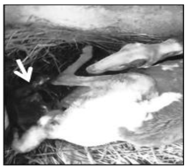
Figure 1: Recumbent Ewe after delivery of the first lamb (White arrow)

In this study, a case of dystocia in a 3-year old Balami ewe that was resolved by manual