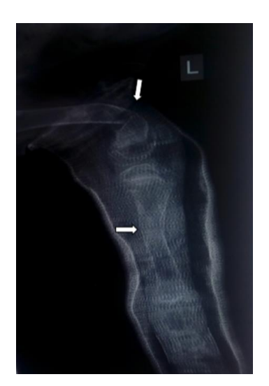
FIGURE VI: Showing a case of nutritional osteopenia in a 4-month-old male Rottweiler breed. Note the secondary fracture at the distal metaphysis of the femur (Arrow) due to apparent weakness and fragility of the bone.