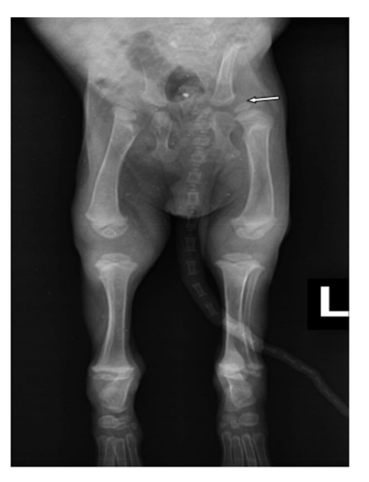
FIGURE V: Showing a case of bilateral femoral fracture induced by nutritional osteopenia in a 3-month-old male Boerboel. Note the thin cortices and the relatively large medullary cavities of the femur and tibia bones.

FIGURE IV: Showing a case of bilateral femoral fracture induced by nutritional osteopenia in a 3-month-old male Boerboel. Note the thin cortices and the relatively large medullary cavities of the femur and tibia bones.