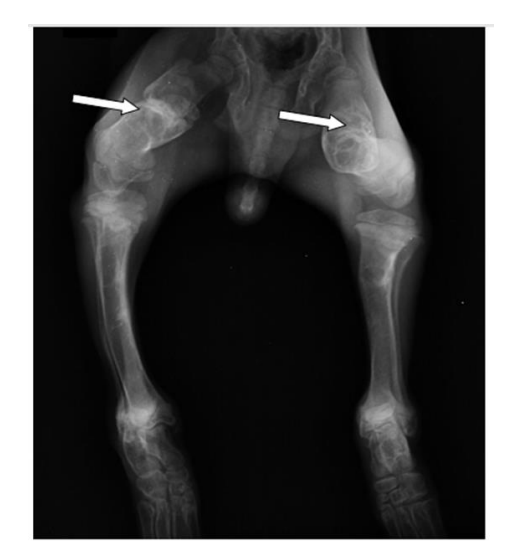
FIGURE IV: Showing a case of bilateral femoral fracture induced by nutritional osteopenia in a 3-month-old male Boerboel. Note the thin cortices and the relatively large medullary cavities of the femur and tibia bones.

FIGURE III: A case of hypertrophic osteodystrophy with degenerative elbow joint in a 7-month-old Boerboel dog. Note the detached ulna, the curved radio-ulna bones and distal epiphysis of