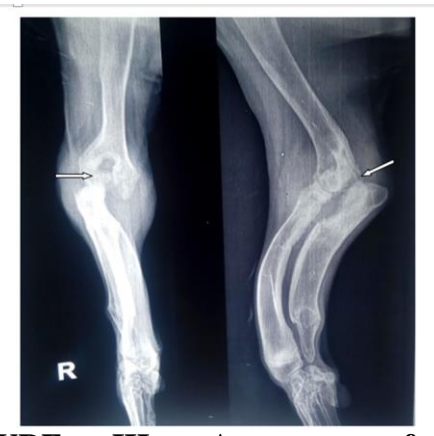
FIGURE III: A case of hypertrophic osteodystrophy with degenerative elbow joint in a 7-month-old Boerboel dog. Note the detached ulna, the curved radio-ulna bones and distal epiphysis of

FIGURE II: Showing distribution of anatomic location of fractures among dogs presented with varying bone disease conditions