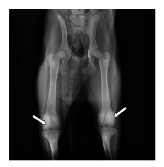
FIGURE VII: Showing a case of nutritional osteopenia in a 4-month-old male Rottweiler breed. Note the secondary fracture at the distal metaphysis of the femur (Arrow) due to apparent weakness and fragility of the bone.

FIGURE VI: Showing a case of nutritional osteopenia in a 4-month-old male Rottweiler breed. Note the secondary fracture at the distal metaphysis of the femur (Arrow) due to apparent weakness and fragility of the bone.