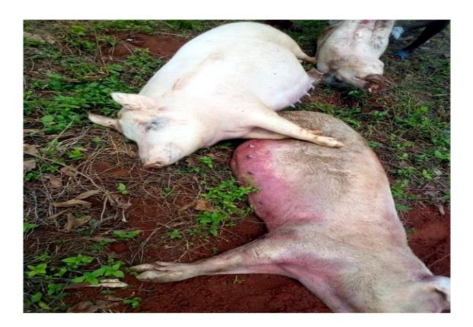
Fig. 2: Mortality resulting from ASFV in mixed breeds of pigs in Ogun State. (Dead Pigs)

In this study, phylogenetic analysis of the ASFV sequences suggests that ASFV II (Fig. 3) was responsible for the outbreak of viral hemorrhagic fever in the Oke-aro farm settlement. Using phylogeny, we could not ascertain if our isolates clustered with the reported ASFV II from Nigeria as different segments of the p72/B646L gene were amplified in both studies making sequences from both studies too divergent to be aligned. However, isolates from this study clustered with recent ASFV II causing major outbreaks in many parts of Europe, Asia, and Tanzania (Fig. 3).