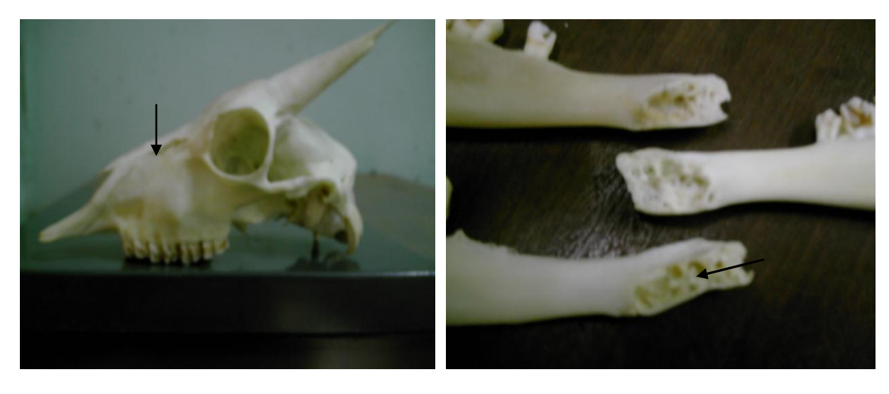
Fig. 1: Arrow showing interacting area between the nasal, incisive and maxilla bones

WDA: Animals without dental abnormalities