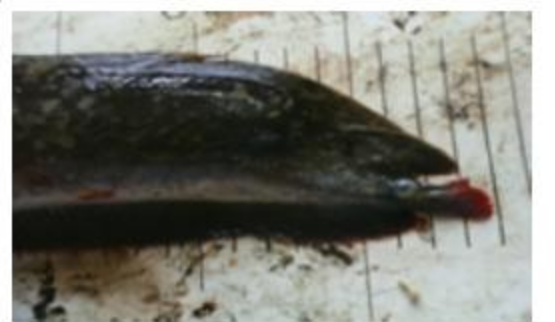
PLATE III: C. gariepinus with severe erosion of the anal and caudal fins caused by A. hydrophila. Skin at the fin bases were swollen and bright red from hemorrhag