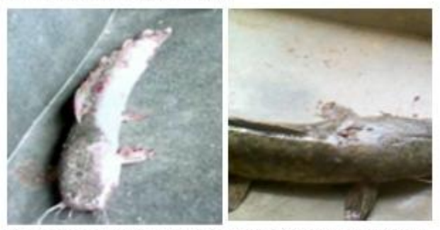
PLATES I and II: C. gariepinus that are infected with A. hydrophila. Haemorrhages and ulceration are pronounced.

Results are presented as means with standard deviations. All data collected were subjected to analysis of variance (ANOVA). Variant means were separated using Duncan Multiple range test. Mean differences with p<0.05 were considered statistically significant.