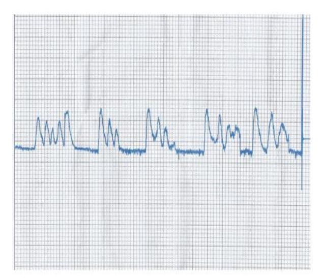
Figure I : Contractile effects of Ananas comosus juice on isolated pregnant rat uterus