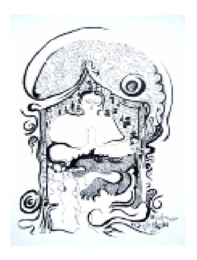
Figure 8. Practicing believers , water colour on paper, 2008