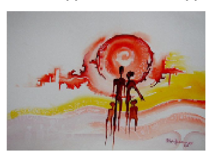
Figure 7. An African family in Japan. water colour on paper, 2008