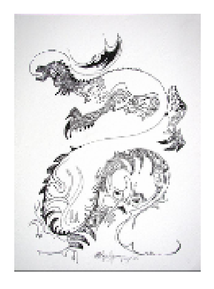
Figure 4.Dragons and fire