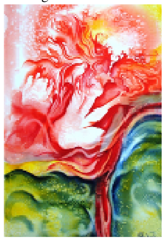
Figure 1. On love and lovers water colour on paper, 2008