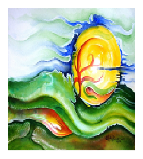
Figure 9. Farewell to Spring, water colour on paper, 2008