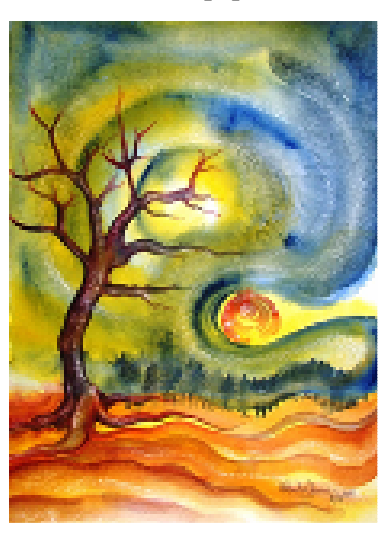
Figure 10. Farewell to Autumn , water colour on paper, 2008