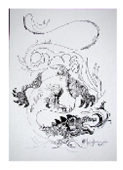
Figure 3. Dragons and fire.