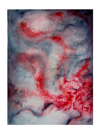
Figure 2. In the night darkly water colour on paper, 2008