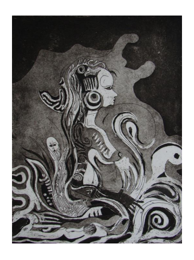
And the waves escort her water colour on paper, 2008