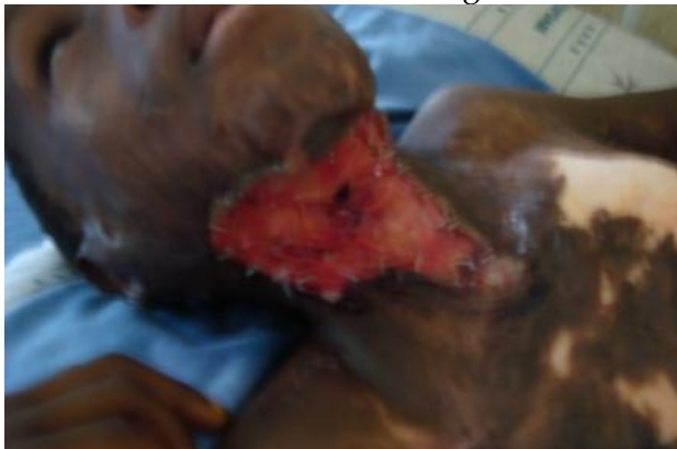
1a. Skin defect covered with integra