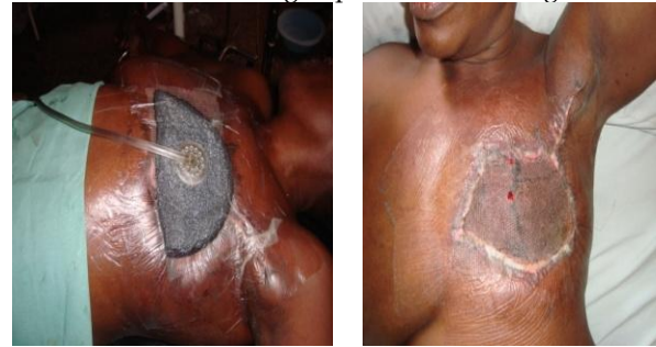
4a. VAC bolster dressing in place 4b. Good graft take

The challenge with this technique of skin graft stabilization however may be its cost effectiveness. This is especially important in a resource poor environment like ours, with limited funds available for medical care. Other researchers have suggested cheaper alternatives to the conventional VAC machine. These alternatives include the regular suction machines, surgical vacuum bottles or even weight loaded syringes. 15,16