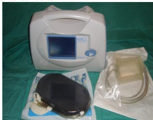
Figure 2. Vacuum Assisted Closure (VAC) device, with consumables

Graft-take was excellent in all patients with graft survival above 95% in all cases (table 1). This is similar to reports from other studies on Negative Pressure Wound Therapy stabilization of skin grafts. In theory, a minimum downward pressure of 25mmHg is required by the tie-over dressing to exceed capillary pressure and prevent haematoma formation. 11