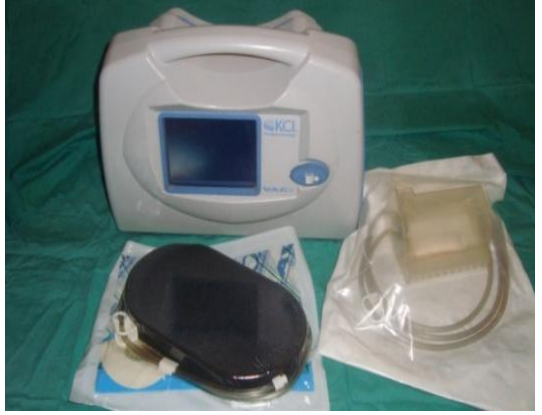
Figure 2. Vacuum Assisted Closure (VAC) device, with consumables

Graft-take was excellent in all patients with graft survival above 95% in all cases (table 1). This is similar to reports from other studies on Negative Pressure Wound Therapy stabilization of skin grafts. In theory, a minimum downward pressure of 25mmHg is required by the tie-over dressing to exceed capillary pressure and prevent haematoma formation.<sup>11</sup>