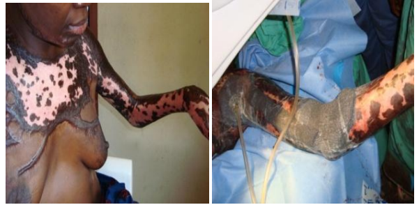
6c. Good graft take

6a. Contractures 6b. Graft stabilization with VAC