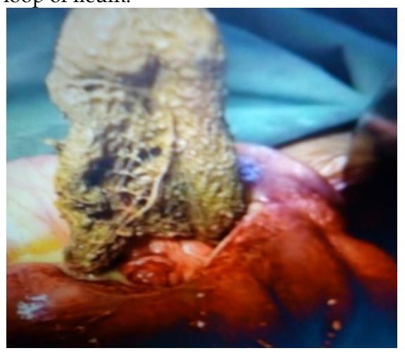
Figure 2. Post-operative picture of a surgical mop/towel completely intra-luminal in a loop of ileum.

Figure 1 . Surgical mop partly intra-luminal with multiple perforation and walled off by loop of ileum.