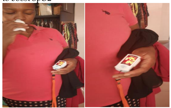
Figure 2b. Use of improvised handheld respirator to boost SpO2

A repeat chest radio-graph showed a marked improvement and he was discharged home for follow-up treatment.