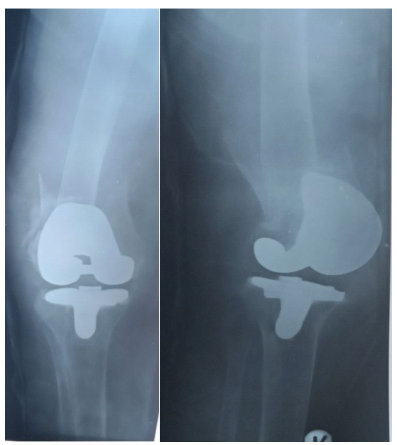
Figure 5. Anterior-posterior and Lat x-ray views of the right knee showing the peri-prosthetic fracture