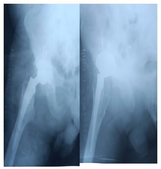
Figure 3. Post-operative Anterior-posterior and lateral x-ray films of the right hip.