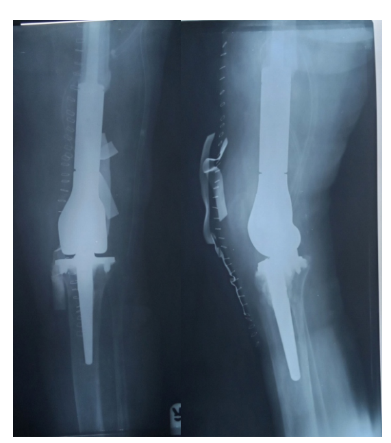
Figure 6. Anterior- posterior and lateral x-ray views of the right knee following the distal femoral replacement

She subsequently had distal femoral replacement, 8 weeks after the fall. [Figure 6]