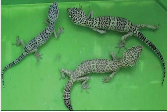
Fig. 1. Three leopard geckos (two females and 1 male) received by veterinary practitioners from a breeder colony in Buenos Aires, Argentina with a history of diarrhea, anorexia and cachexia.