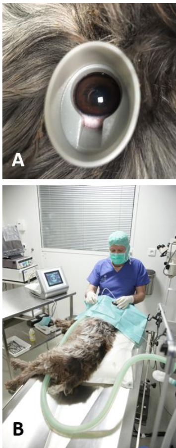
Fig. 1. (A): Coupling cone inserted into the palpebral fissure of the patient being treated. The aperture of the coupling cone had to be centered on the cornea so that the ultrasound beam reached precisely the ciliary processes. (B): General view of the device.

injection of medetomidine (2 µg/kg) (Domitor®, Vetoquinol, Lure, France), ketamine (5 mg/kg) (Imalgene®, Merial, Lyon, France), and morphine (0.3 mg/kg) (Lavoisier, Paris, France), followed by inhalation of isoflurane gas (1.5 to 3% of an air mixture of 30% - oxygen 70%) (Vetflurane®, Virbac, Carros, France). The anaesthetised dog was positioned in dorsal or lateral recumbency with its head stabilized in a hollow cushion, as for an intraocular surgery. The combination probe / coupling cone of the HIFU device was available in three sizes (16, 18, 20 mm), corresponding to the different sizes of eyeballs to be treated. The operator selected the coupling cone size matching the palpebral aperture of the patient being treated (Fig. 1A). Once the coupling cone was centered on the patient's cornea, it was manually held by the operator. The corresponding probe was then inserted in the upper part of the cone (Fig. 1B). The cavity created between the eye surface of the patient, the edge of the coupling cone and the probe was filled with 5 mL of sterile saline, through the central aperture of the device (Fig. 2).