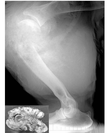
Fig. 1. Mediolateral radiograph shows a destructive bone lesion with pathological fracture of the proximal third of the humerus. The tumor is densely sclerotic, containing a considerable amount of mineralized osteoid. Small picture in the inset shows gross appearance of the osteosarcoma, with destruction of the cortex and a soft tissue mass with osteogenic white areas.

right shoulder, elbow, and humerus, and a lateral view of the thorax were obtained. The area over the proximal humerus was clipped and surgically prepared to obtain a fine needle aspiration (FNA) for the cytological evaluation of the mass. Radiographs of the limb showed an osteolytic sclerosing lesion with irregular rim, mild periosteal reaction and irregular cortex, intramedullary extension and pathologic fracture of the metaphyseal area, severe invasion and complete detachment of the right humeral epiphysis (Fig. 1).