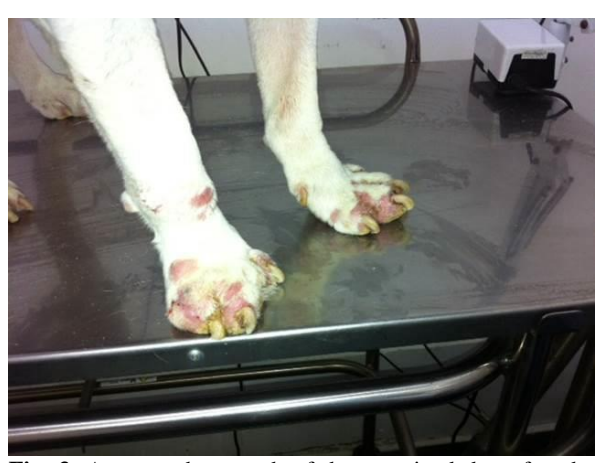
Fig. 3. A gross photograph of the examined dog after the acaricidal treatment. Note the significant improvement in the appearance of the feet after 4 weeks of the treatment. Also, loss of the digit in the right thoracic limb is clearly evident in this photograph.