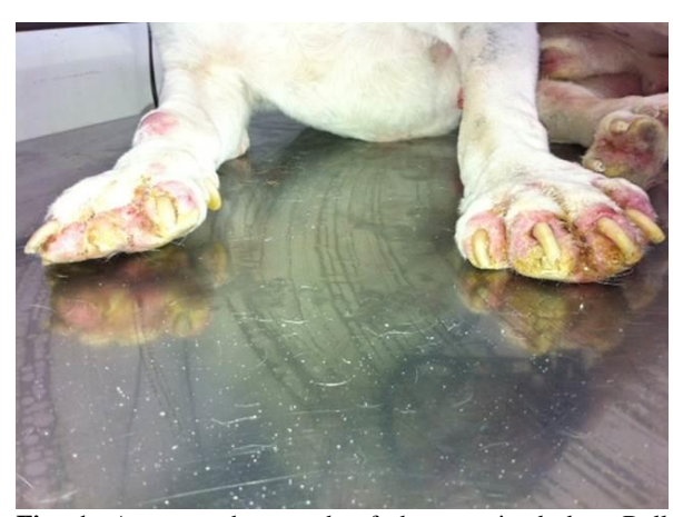
Fig. 1. A gross photograph of the examined dog, Bull Terrier, prior to the treatment. The "flat feet" appearance and the loss of the digit in the right thoracic limb are clearly evident.

revealed that the onset of clinical signs dates back to a year prior to the presentation of the case. Clinical observations revealed that all the feet were swollen, erythematous, crusted, hyperkeratotic, ulcerated and painful with loss of a digit from the right thoracic limb (Fig. 1).