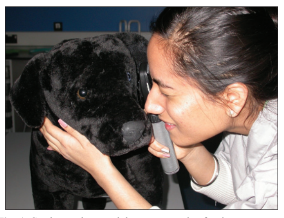
Fig. 1. Student using model eye to practise fundoscopy.