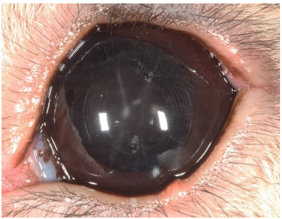
Fig. 2. Pseudophakia OS 8 weeks after surgery. Concentric rings from the optical portion of the IOL can be noted in this image (Case 1).

Six months after surgery the animal presented for a third recheck. No changes were noted on ophthalmic examination since the previous exam and IOP was 15mmHg OD and 21mmHg OS. At that time it was recommended to continue diclofenac OU SID.