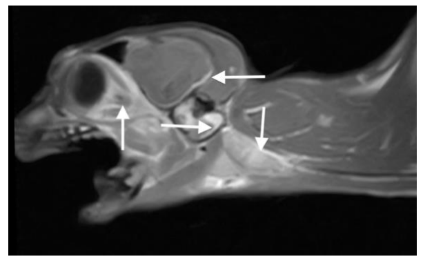
Fig. 2. Parasagittal SE T1+c image. Note arrows indicate: retrobulbar steatitis ( \uparrow ), meningitis ( \Leftarrow ), otitis media ( \rightarrow ), medial retropharyngeal lymphadenitis ( \blacklozenge ).