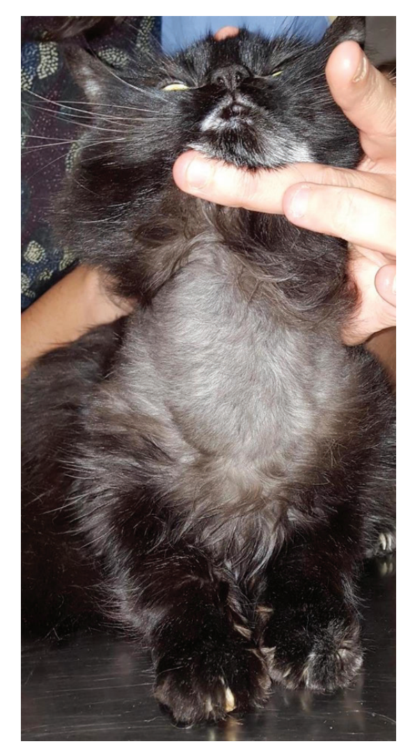
Fig. 1. Photograph of the cat presented with a large mass in the ventral right cervical region.

Parathyroidectomy was recommended. In order to plan surgery, a computed tomography (CT) of the cervical