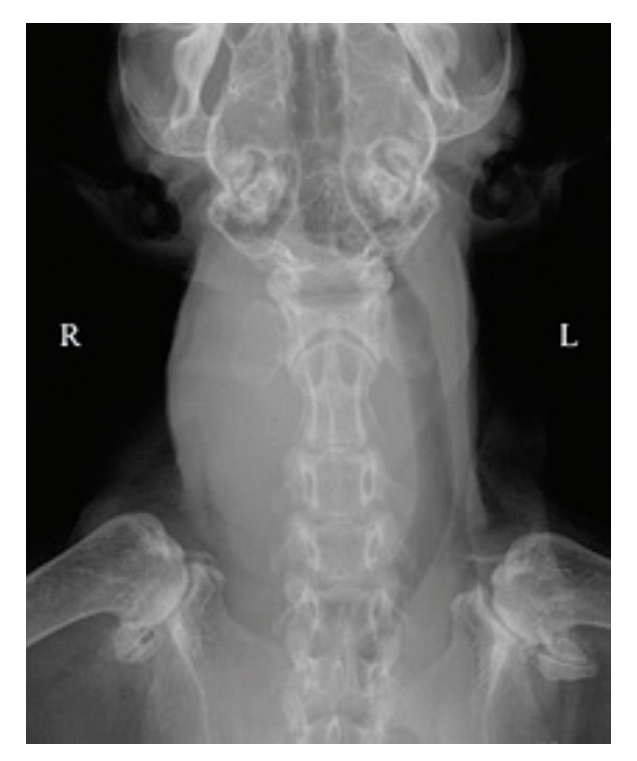
Fig. 2. Ventrodorsal radiography of the neck showing a large homogeneous right cervical soft-tissue mass with marked lateral deviation of the cervical trachea to the left.

Determining the origin of a cervical mass is important as it may have implications for treatment (Phillips et al. , 2003). While some functional cystic thyroid lesions can be managed medically, surgical excision is considered