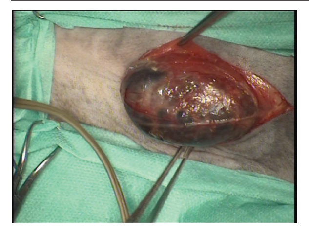
Fig. 4. Photograph of the mass obtained during surgery. The mass is well-encapsulated and measured 8 cm \times 5 cm.