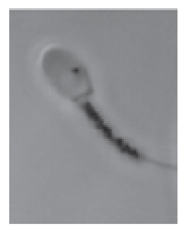
Fig. 2. The appearance of formazan granules in the midpiece and the head of boar sperm after incubation with MTT, observed by a phase-contrast microscope (400\times) ; Modified from Van den Berg (2015).

Besides using a spectrophotometer, the formation of formazan granules in boar sperm was observed through microscopic analysis (Fig. 2) (van den Berg, 2015). After incubation for varying periods, 5 \mu l of the MTT stained samples without a solubilizing agent was placed onto microscope slides and covered with cover