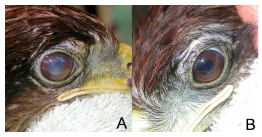
Fig. 3. (A) One week postoperatively, mild corneal edema and posterior capsular opacity were investigated OD. (B) Mild corneal edema was evident OS.