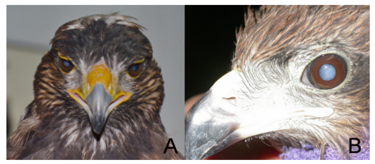
Fig. 1. Hypermature cataract in an unknown age male black kite: (A) OU and (B) OS. Other anterior parts of both eyes were normal.

The general physical examination was normal. The visual examination revealed that the bird showed blindness, determined by negative menace and absence of visual tracking response. The dazzle reflex was positive OU. The direct pupillary light reflex was brisk and completed OU. Consensual pupillary light reflex was not carried out due to complete optic nerve fiber decussation at the optic chiasm in birds (Kern et al., 1984; Bayon et al., 2007). Ocular examination was carried out using a slit-lamp biomicroscope (SL-15 portable slit lamp, Kowa Company, Ltd., Nagoya, Japan). The cornea, anterior chamber, and iris were normal. A hypermature cataract was observed OU (Fig. 1). The fundus could not be assessed due to the substantial opacity of the lenses. A clinical diagnosis of cataract OU was made based on the appearance