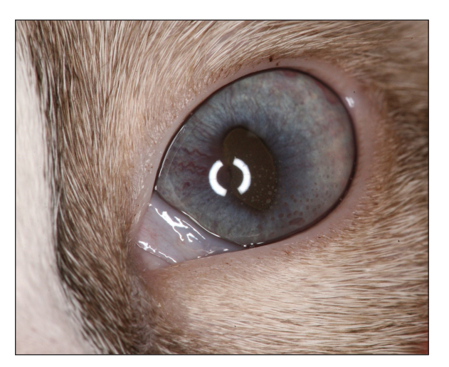
Fig. 1. A 4-month-old female entire Snowshoe kitten with bilateral uveitis. Clinical signs included corneal edema, keratic precipitates, aqueous flare, rubeosis iridis and miosis. The etiology was FIP.

This study aimed to describe cases of feline uveitis focusing on nontraumatic and nonreflex causes. The objectives were to: 1) establish etiology based on recorded clinical findings, diagnostic investigation, and follow-up information and 2) compare cases of idiopathic uveitis to cases with a confirmed etiology (signalment and ophthalmic examination findings). We hypothesized that performing diagnostic testing would increase the likelihood of finding an underlying disease and used a 12-month follow-up period to allow underlying diseases to become apparent.