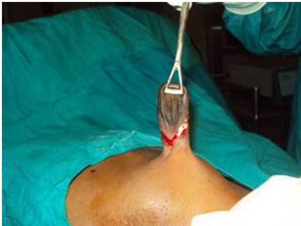
Figure 3: V-shaped cuts leaving two half cones