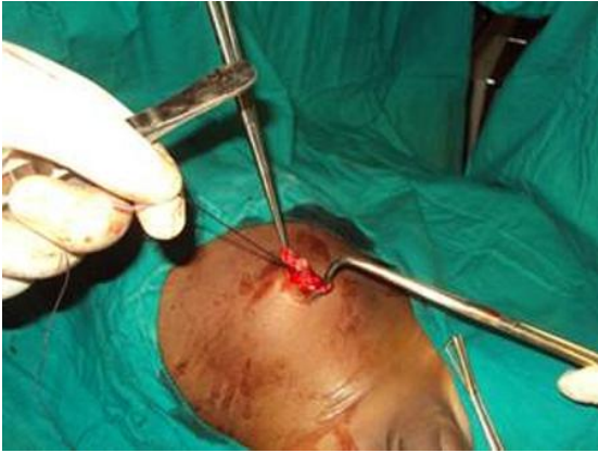
Figure 4: Facial defect repair