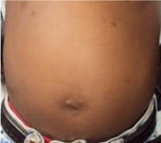
Figure 6: Aspect of the abdominal wall 2 years postoperative