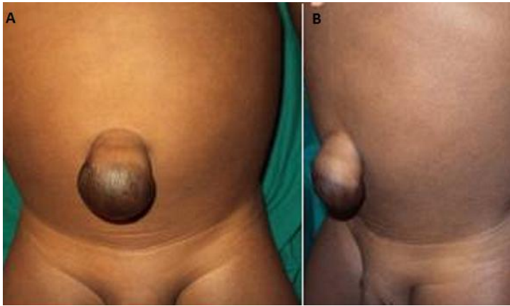
Figure 1: A and B proboscoid hernia