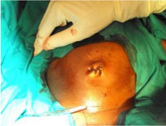
Figure 5: Aspect of the umbilicus at the end of the procedure