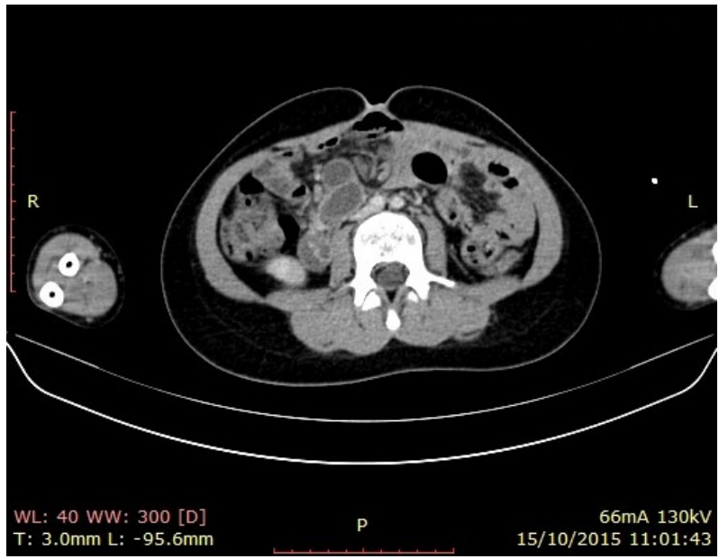
Figure 1: Abdomen uroscan portal phase