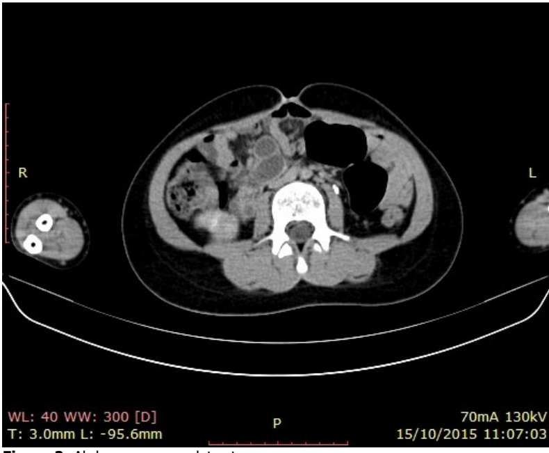
Figure 2: Abdomen uroscan late stage