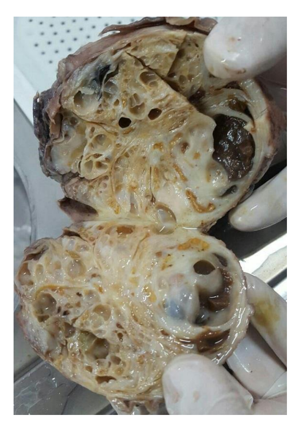
Figure 2: An overview of the mass