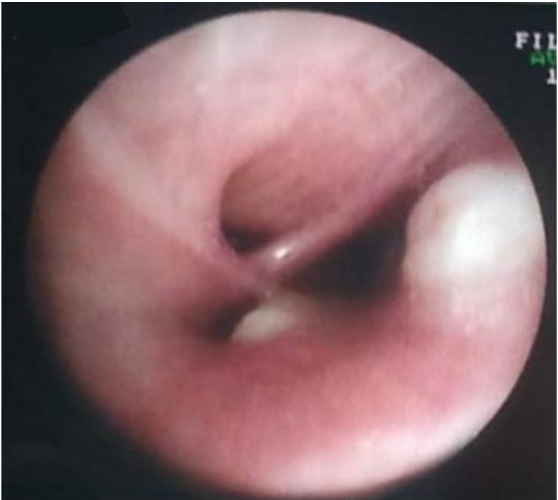
Figure 3 : White granuloma at the entrance of the right upper lobe bronchus